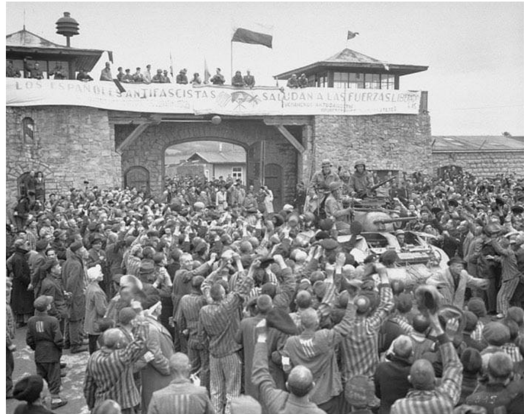
Spanish antifascist prisoners celebrate their liberation from the Nazi death camp at Mauthausen with a banner on May 5, 1945.

Black workers in South Africa had participated in May Day demonstrations since 1928, when their march dwarfed the whites-only demonstration organized by the racist Labor Party. In 1950, the Communist Party of South Africa called for a May Day strike to protest against the Suppression of Communism Act. South African police retaliated with brutal violence, killing 18 people across Soweto. The young Nelson Mandela sought refuge in a nurses' dormitory overnight to escape from the gunfire.